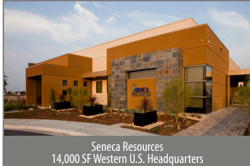
Seneca Resources 14,000 SF Western U.S. Headquarters