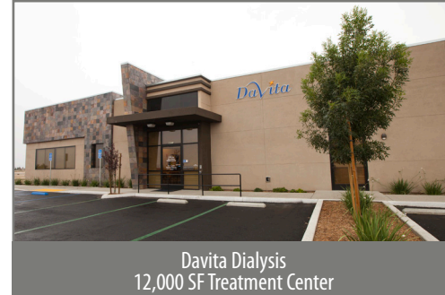
Davita Dialysis 12,000 SF Treatment Center