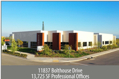
11837 Bolthouse Drive 13,725 SF Professional Offices