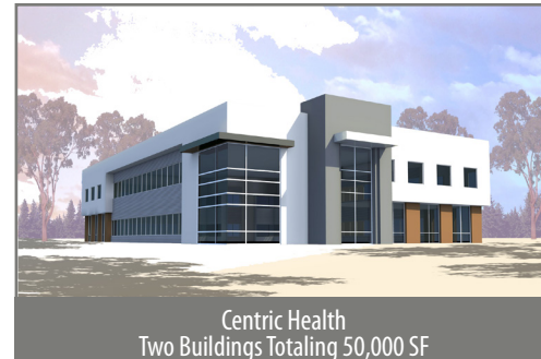
Centric Health Two Buildings Totaling 50,000 SF