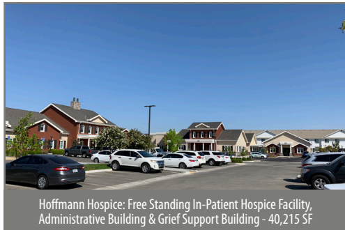
Hoffmann Hospice: Free Standing In-Patient Hospice Facility, Administrative Building & Grief Support Building - 40,215 SF