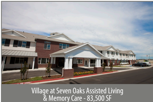
Village at Seven Oaks Assisted Living & Memory Care - 83,500 SF