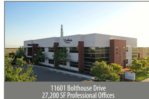
11601 Bolthouse Drive 27,200 SF Professional Offices