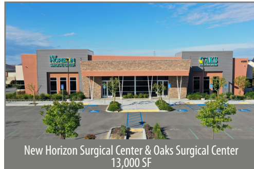
New Horizon Surgical Center & Oaks Surgical Center 13,000 SF