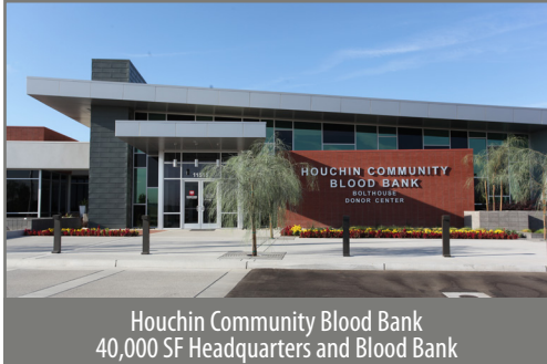
Houchin Community Blood Bank 40,000 SF Headquarters and Blood Bank