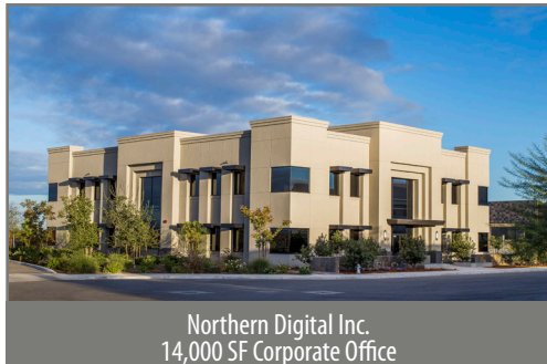
Northern Digital Inc. 14,000 SF Corporate Office