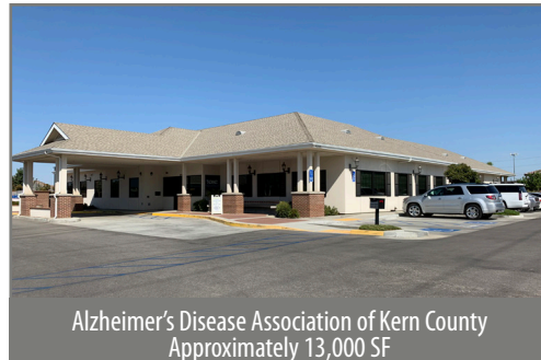
Alzheimer's Disease Association of Kern County Approximately 13,000 SF